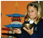
Quotes from Fimel Children:

Thanks to the combined dedication and time given by parents, teachers and the Child and Family Institute in Menlo Park, the students are still talking about the World Peace Village, and its message of faith and acceptance.